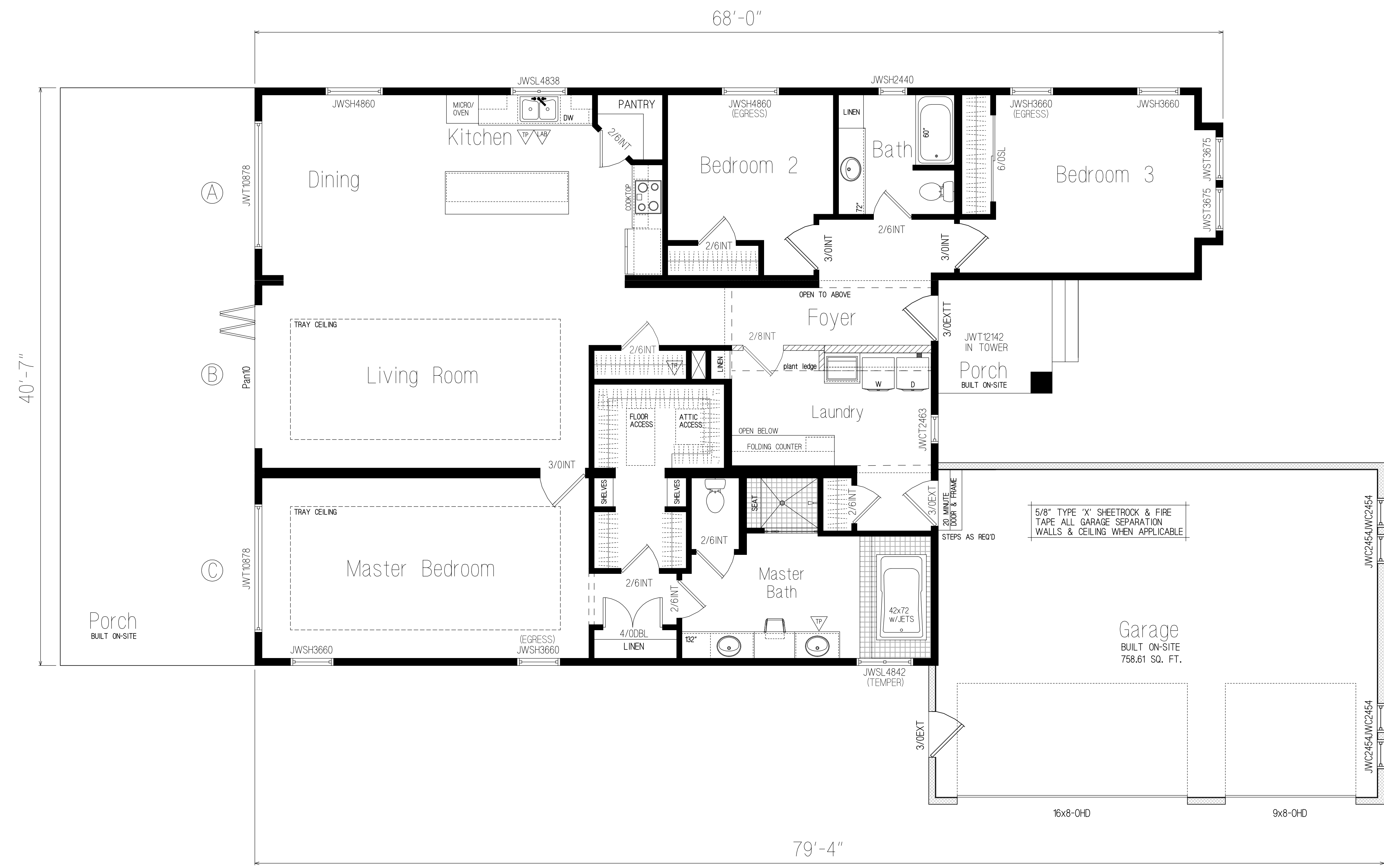
FLOORPLAN 2,210.62 SQ. FT. LIVING AREA

NOTE: INTERIOR WALL DIMENSIONING IS TO FINISH EXTERIOR DIMENSIONS ARE TO WOOD RIM